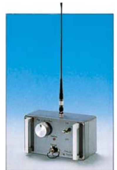
Tug Control Unit

The groundside hardware consists of the tug controller and a ground station unit connected to a portable PC and a chart recorder. This enables data to be simultaneously inspected and recorded digitally while the survey is in progress.